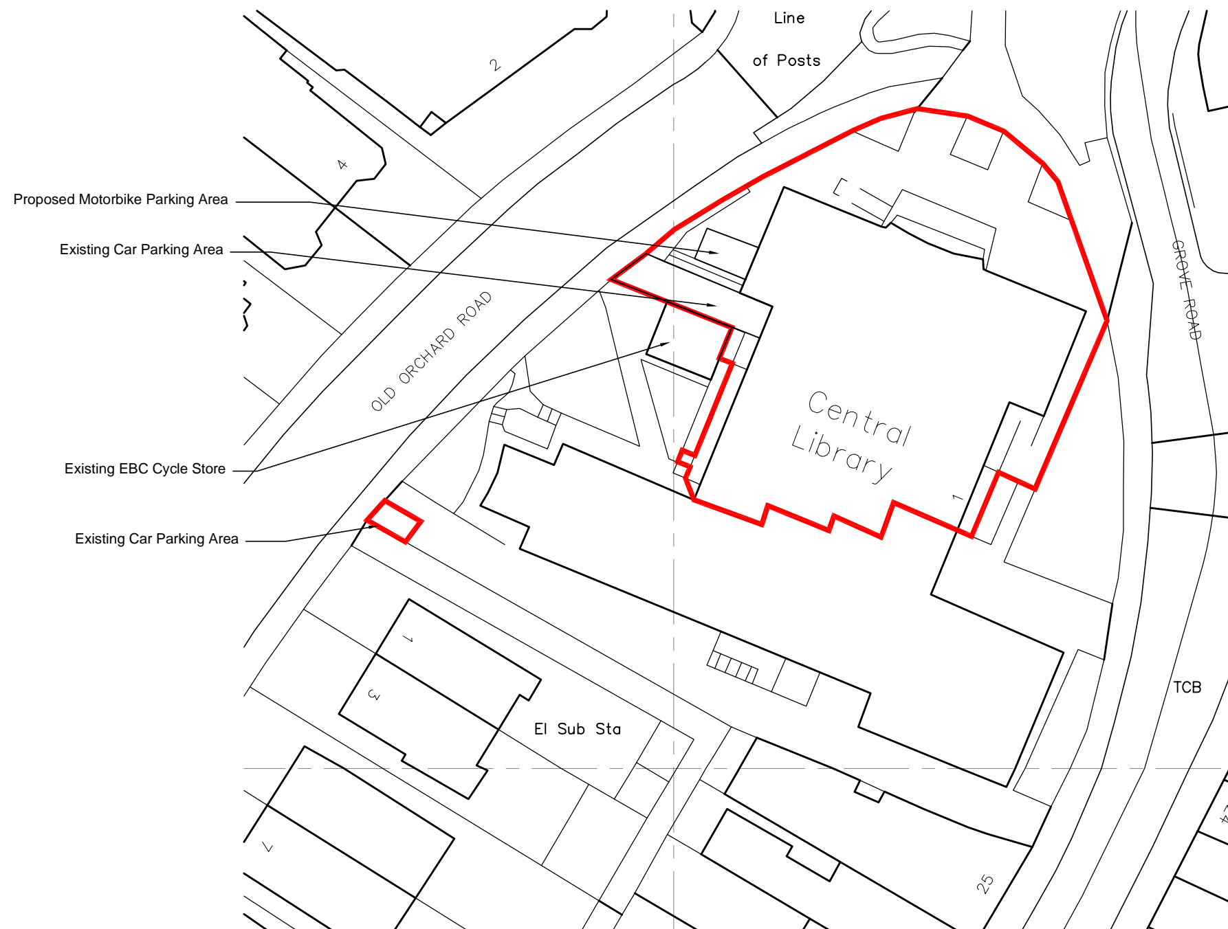
SITE BLOCK PLAN Scale 1:500